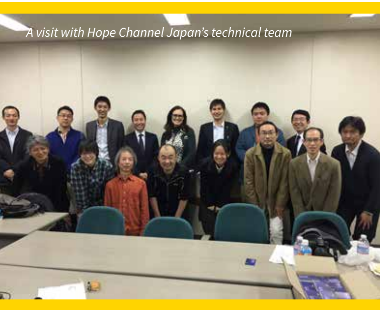
A visit with Hope Channel Japan's technical team

Japan. Media professionals from churches in the Tokyo area came together to train the Hope Channel Japan staff, resulting in the launch of two internet channels—one that streams church services to small congregations and to elderly, housebound viewers and the other that broadcasts short engaging clips on social media as a first step in reaching the public. Health programs, Bible studies, and other shows will soon be available as video-on-demand. They are also making plans to renovate and update their studio facility. 🇯🇵