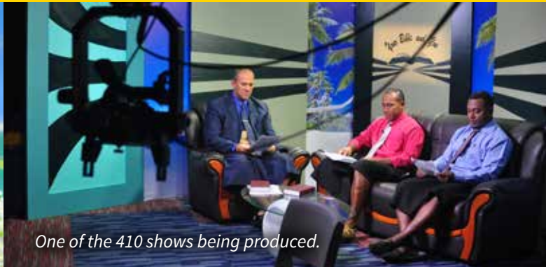
One of the 410 shows being produced.

When Hope Channel began in 2003, our mission was very clear: to spread the gospel message to the entire world through the use of television. But how we were going to accomplish this mission was not quite as clear. How would one channel producing shows in the United States reach a multitude of cultures and language groups in a cost-effective way that makes a huge impact?