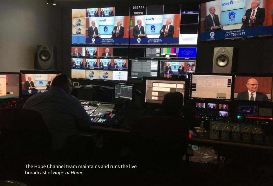
The Hope Channel team maintains and runs the live broadcast of Hope at Home .