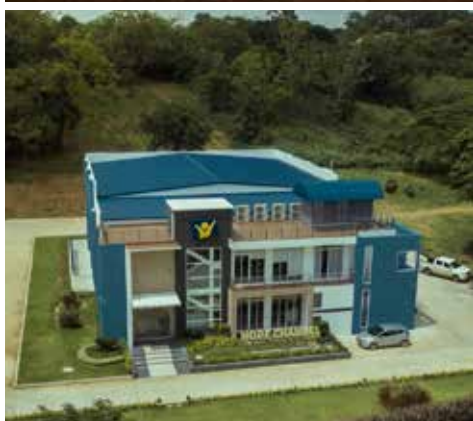
Thanks to the strong support of our donors, a new media center for Hope Channel Southeast Asia was constructed and dedicated.