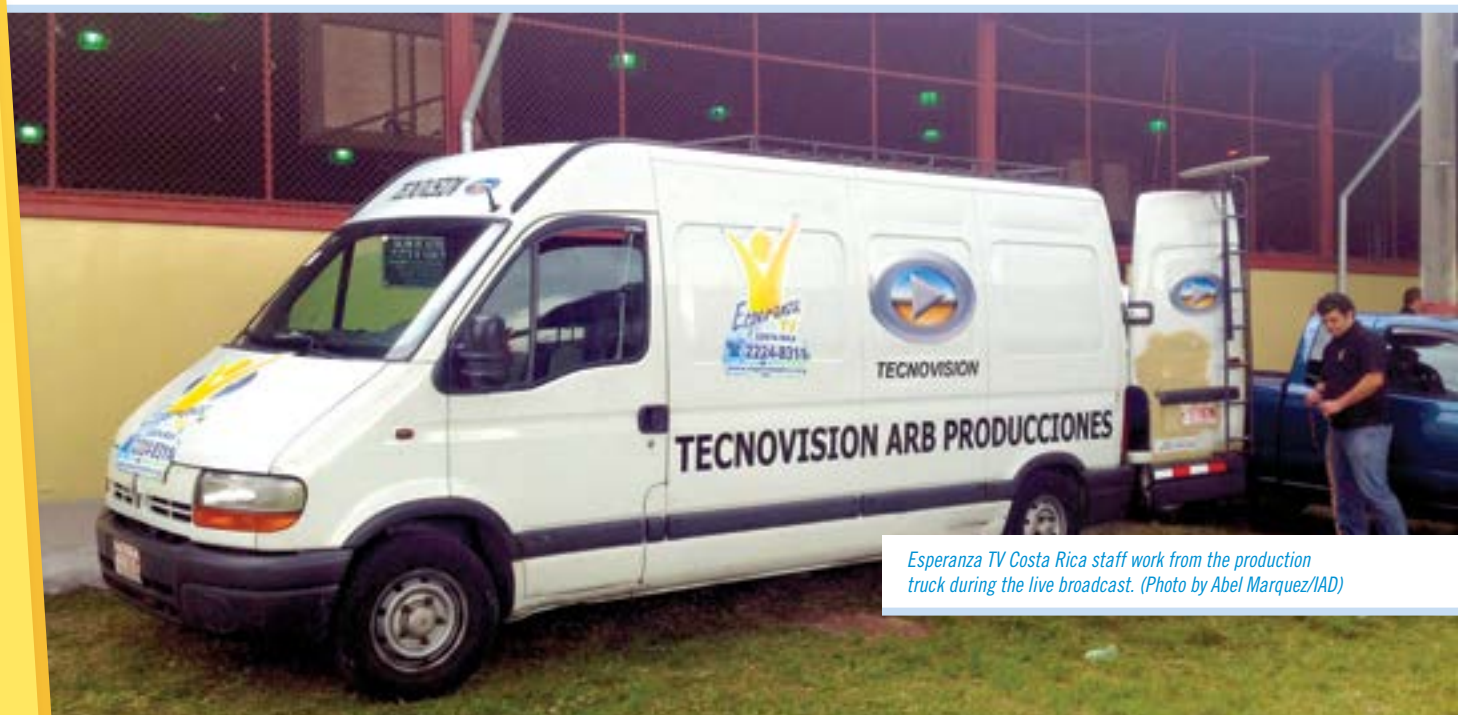
Esperanza TV Costa Rica staff work from the production truck during the live broadcast.

As part of an ongoing campaign, Hope Channel Poland plans to install billboards in various cities throughout the country. As an extension of Hope Channel International, Hope Channel Poland brings inspirational TV content to a Polish-speaking audience. It operates 24/7 and is accessible on Adventist Media Center “Voice of Hope” at www.glosnadziei.com . In addition to television, Hope Channel Poland produces various radio programs in collaboration with Adventist World Radio and National Public Radio.