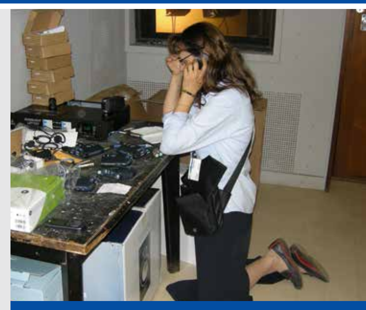
sorting out challenges with the equipment coming into Zambia for the

The first Project Hope was in Lusaka, Zambia and the most recent one was in Japan this year. Some of the other areas where Project Hope has served as a catalyst for new channel development are the Philippines, Fiji, Australia, Bulgaria, Middle East, South Africa, Papua New Guinea, and Jamaica.